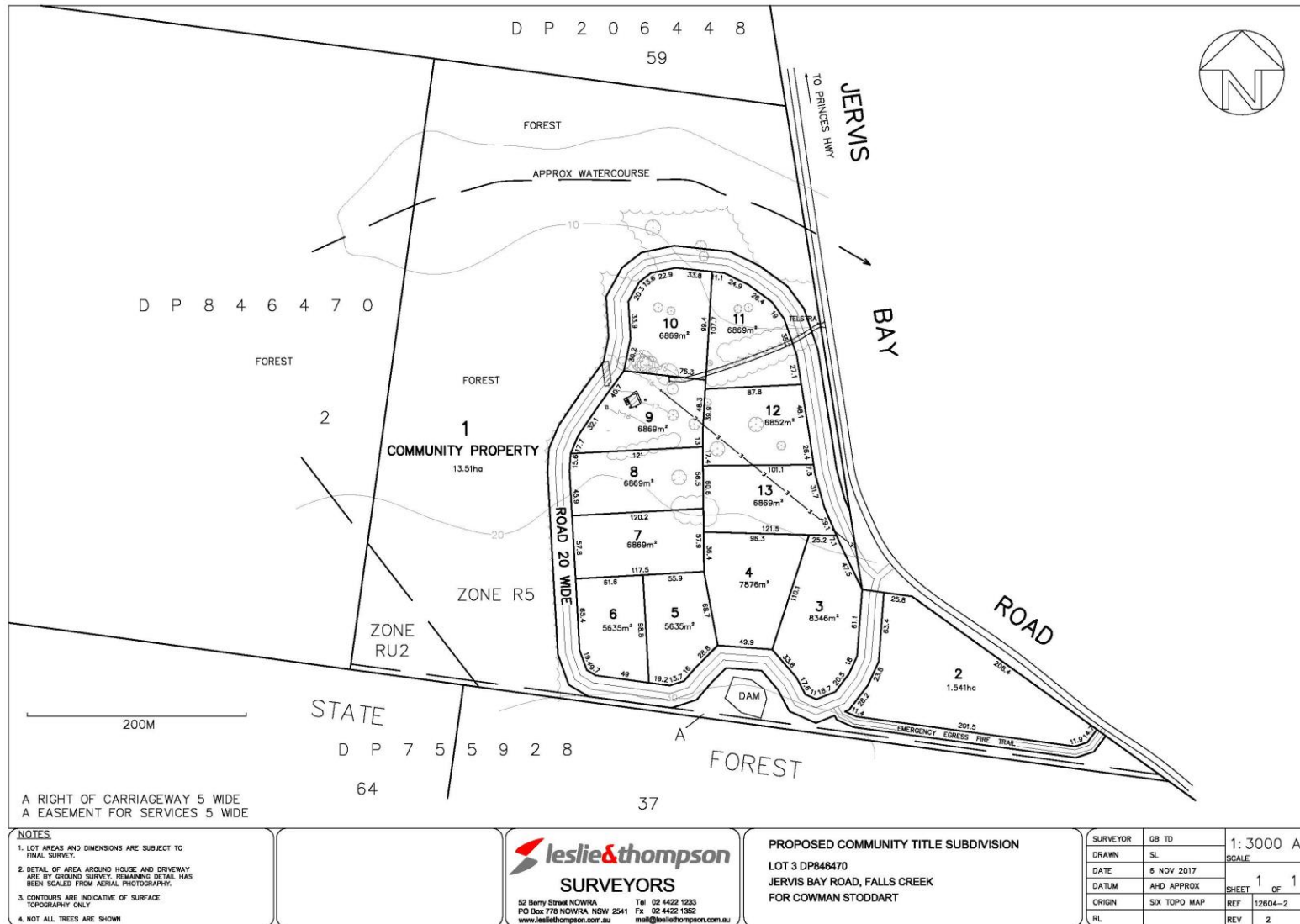
Figure 2: Site plan