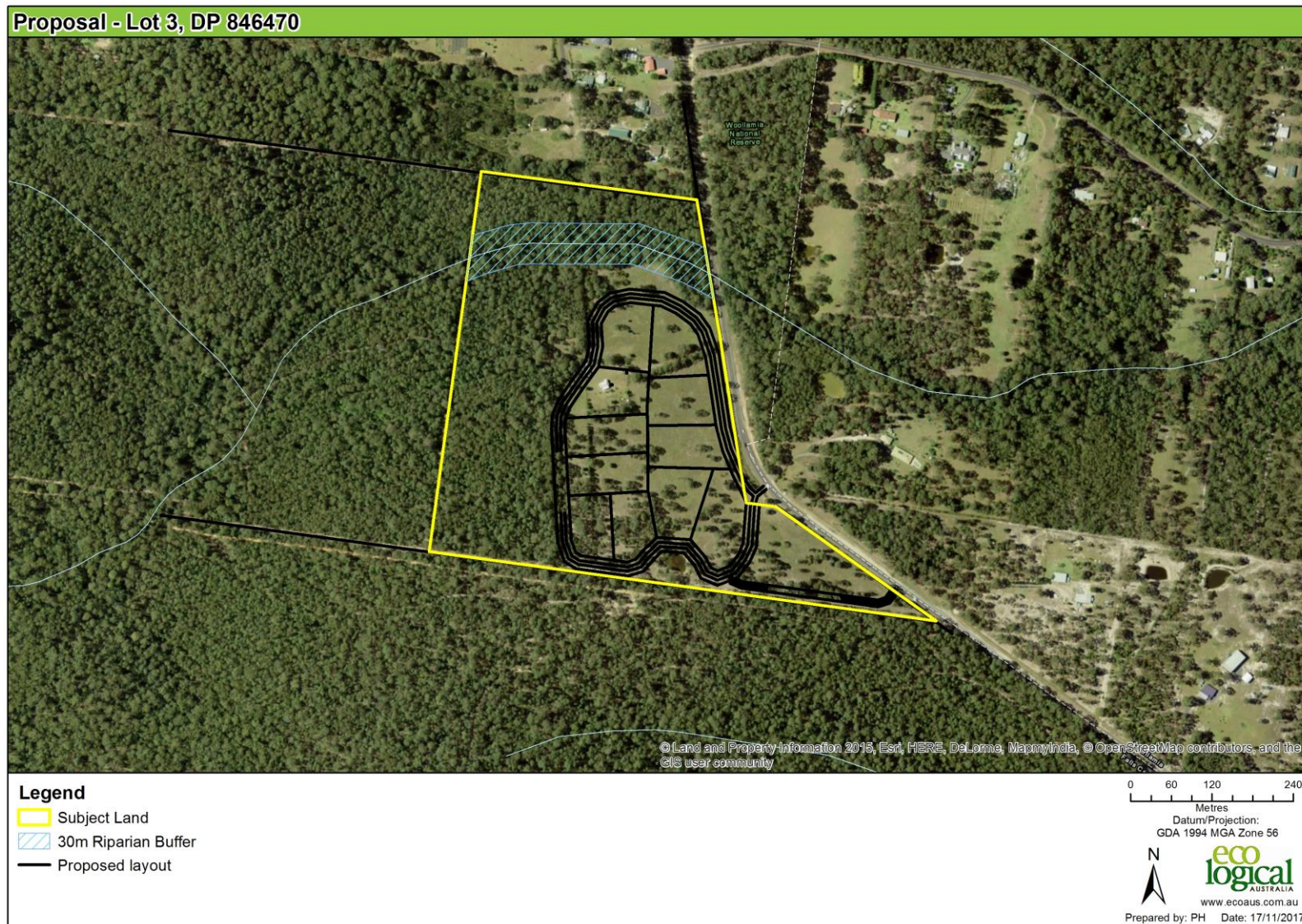
Figure 3: The proposal