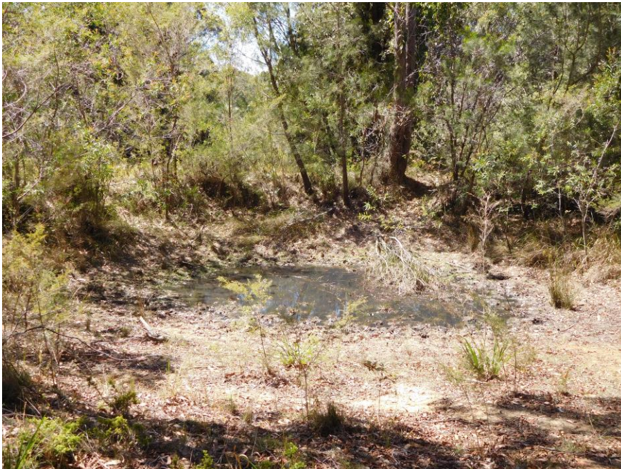
Photo 2: Small dam to NW of main dam where Green and Golden Bell Frog was observed