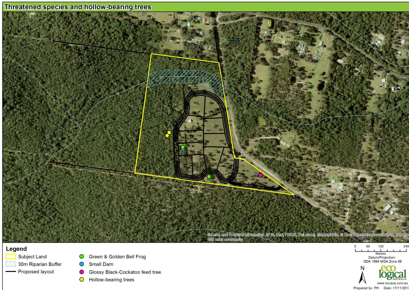
Figure 4: Threatened species and habitat features